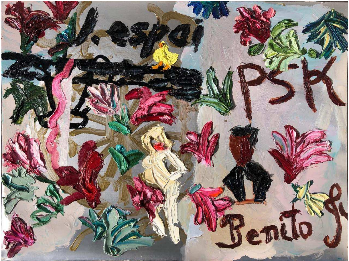
Untitled, series La reina quiere coco, oil on aluminium sheet, 12x16 inches or 30,5x40,6 cm, 2019