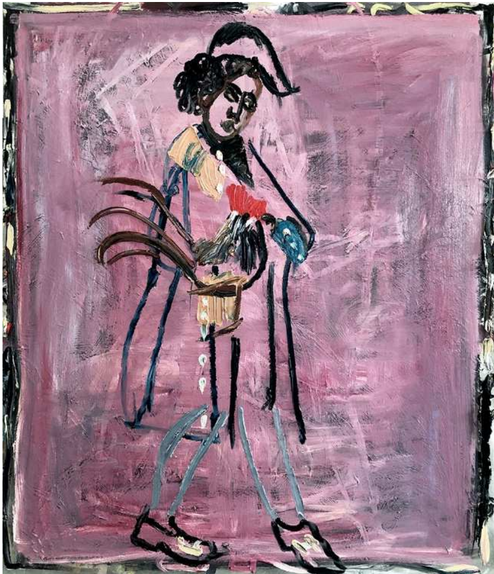
Detail installation - Oil on aluminium sheet – 42x48 inches