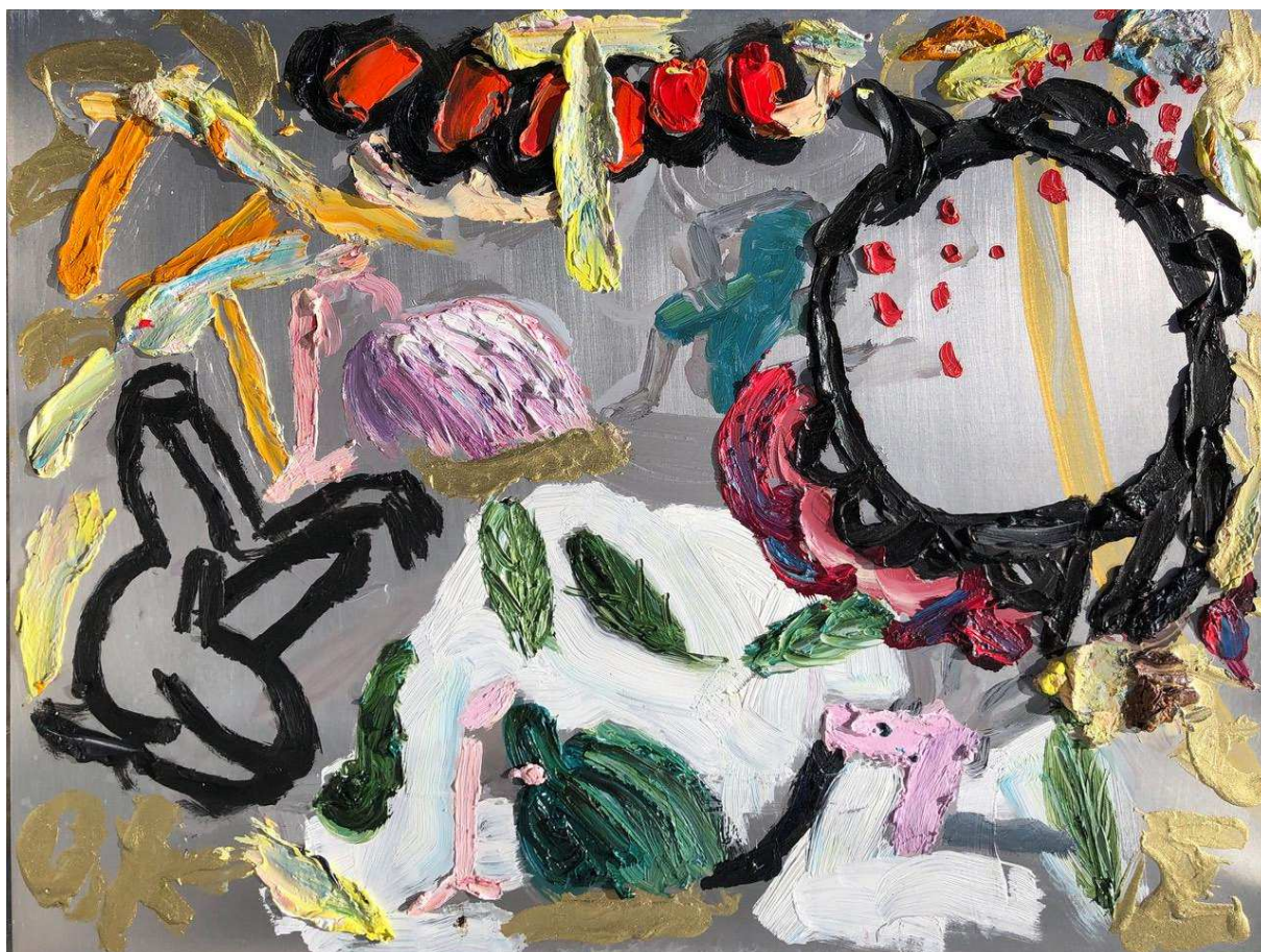
Untitled, series La reina quiere coco, oil on aluminium sheet, 12x16 inches or 30,5x40,6 cm, 2019