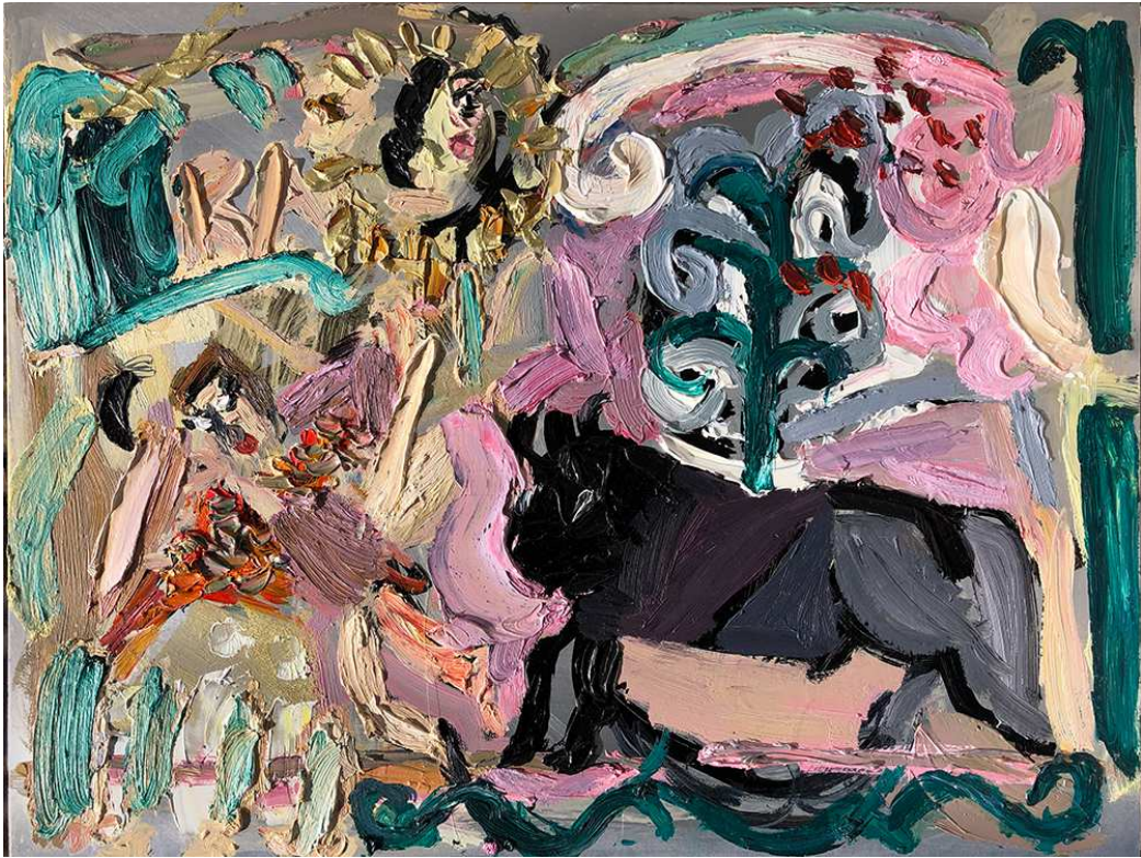
Detail installation - Oil on aluminium sheet – 16x12 inches