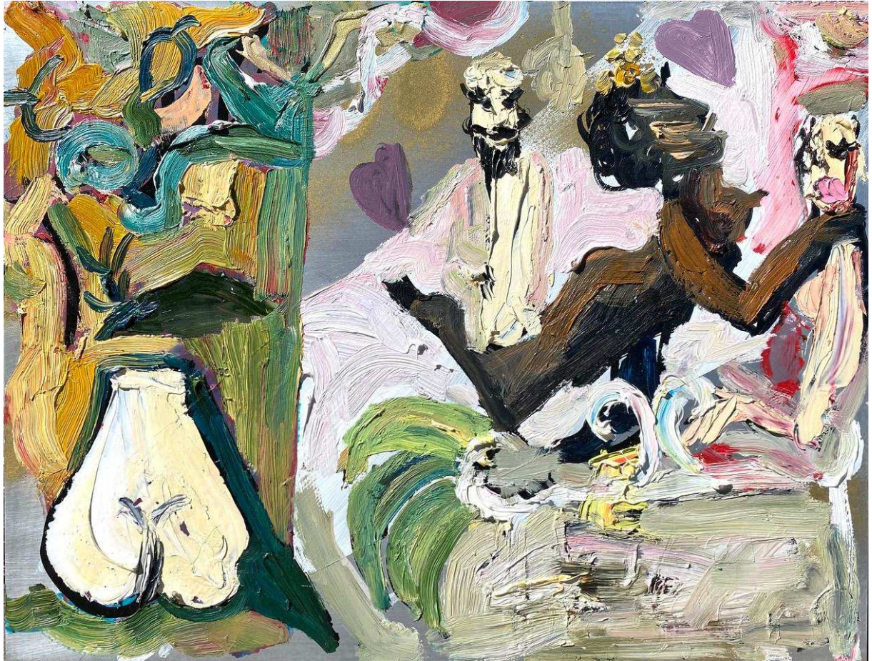
Untitled, series La reina quiere coco, oil on aluminium sheet, 12x16 inches or 30,5x40,6 cm, 2019