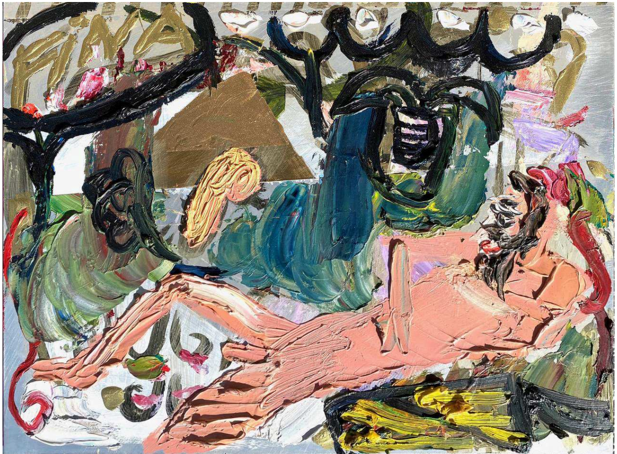
Untitled, series La reina quiere coco, oil on aluminium sheet, 12x16 inches or 30,5x40,6 cm, 2019