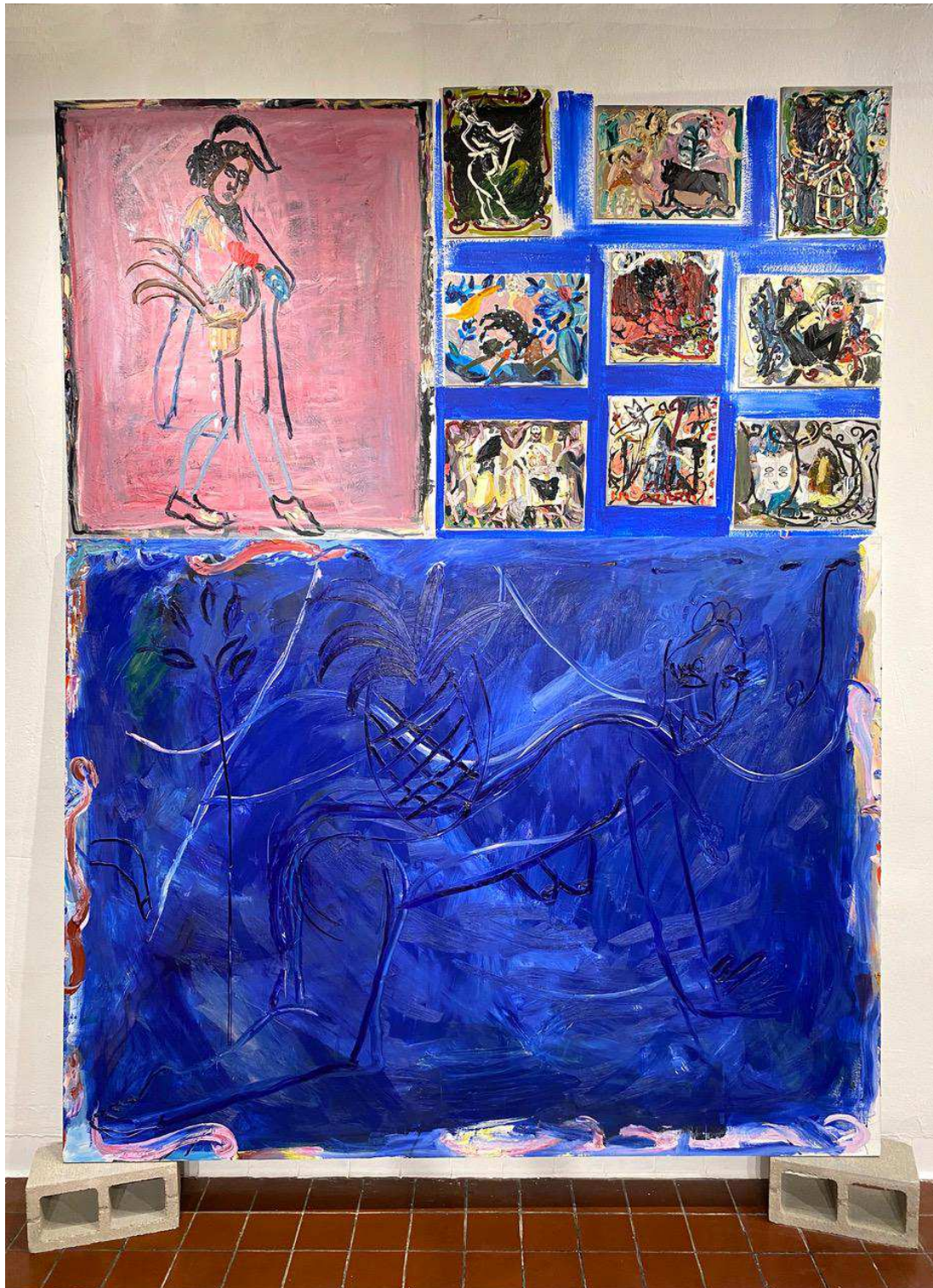
La pina se parte y se comparte, installation, oil on wood and oil on aluminium, 8x10ft, 2019