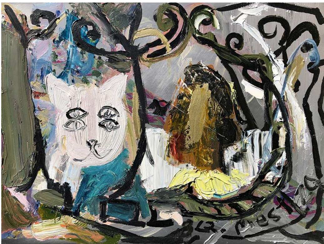
Detail installation - Oil on aluminium sheet – 16x12 inches