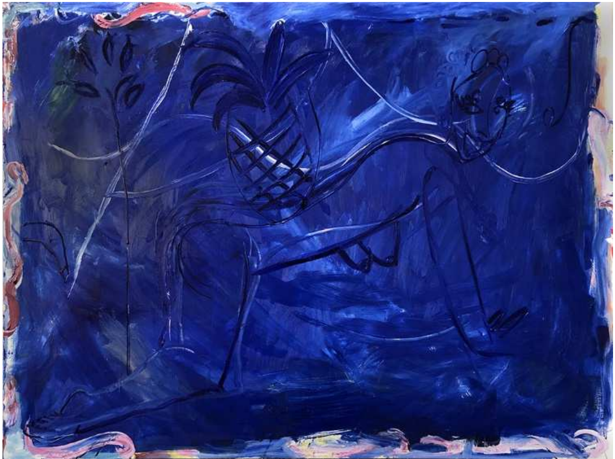
Detail installation - Oil on wood – 92x70x2 inches