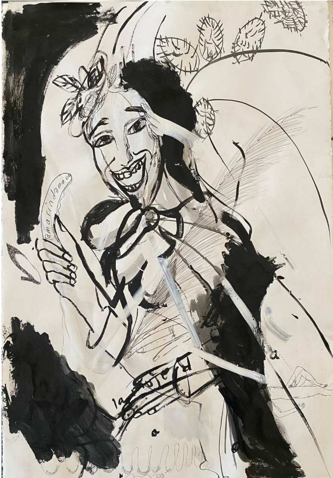
Untitled, series Saints, ink, charcoal and acrylic on paper, 40x30 inches or 102x77 cm, 2017