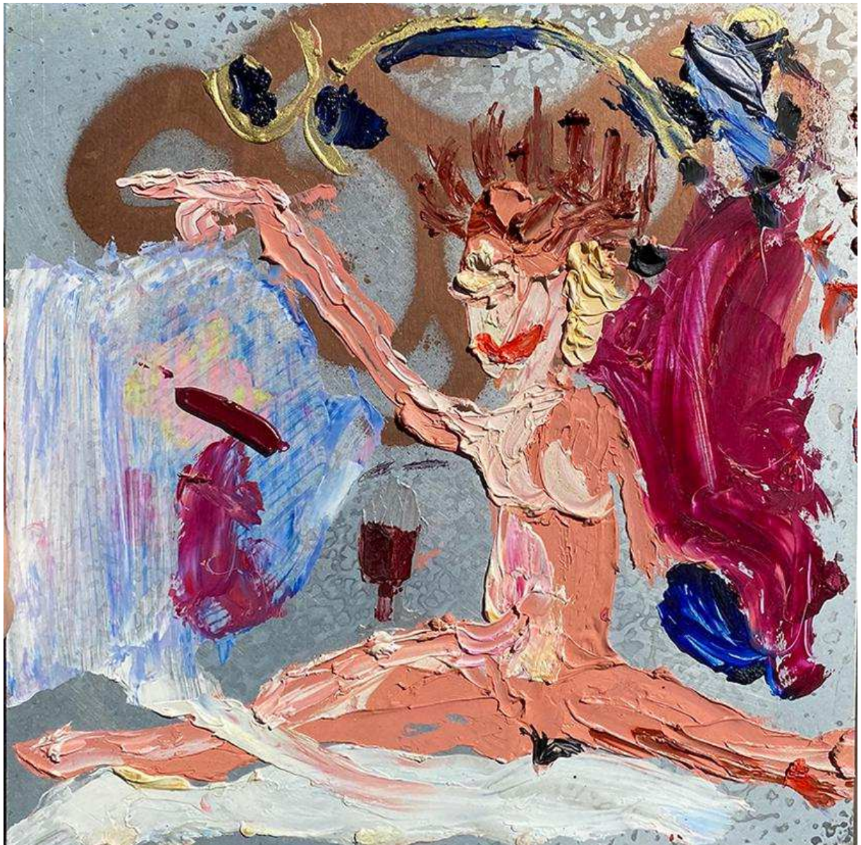
Untitled, series La reina quiere coco, oil on aluminium sheet, 12x12 inches or 30x30 cm, 2019