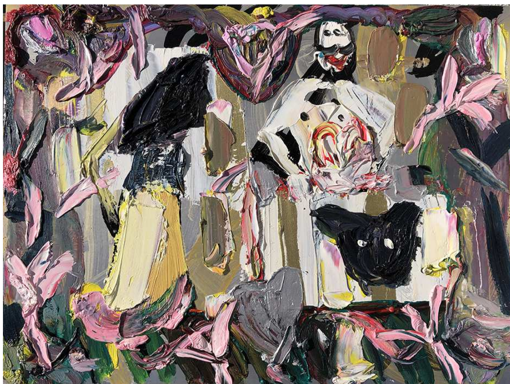
Detail installation - Oil on aluminium sheet – 16x12 inches