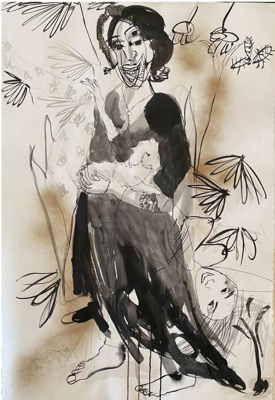
Untitled, series Saints, ink, charcoal and acrylic on paper, 40x30 inches or 102x77 cm, 2017