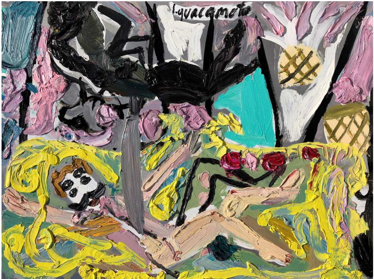
Untitled, series La reina quiere coco, oil on aluminium sheet, 12x16 inches or 30,5x40,6 cm, 2019