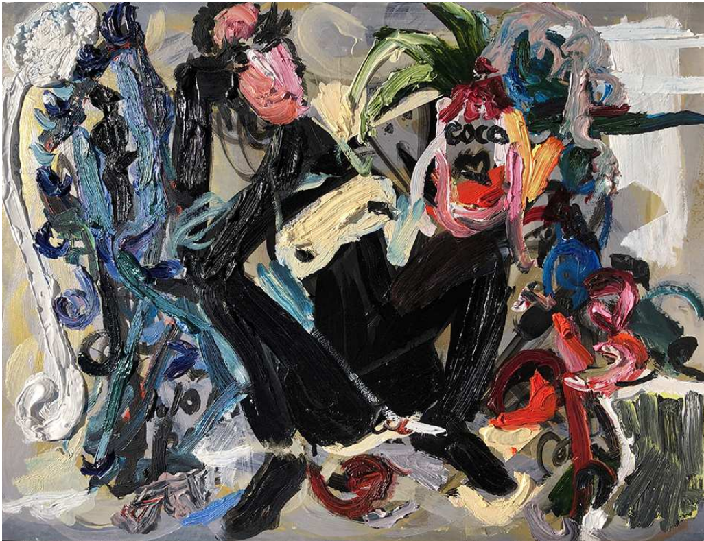
Detail installation - Oil on aluminium sheet – 16x12 inches