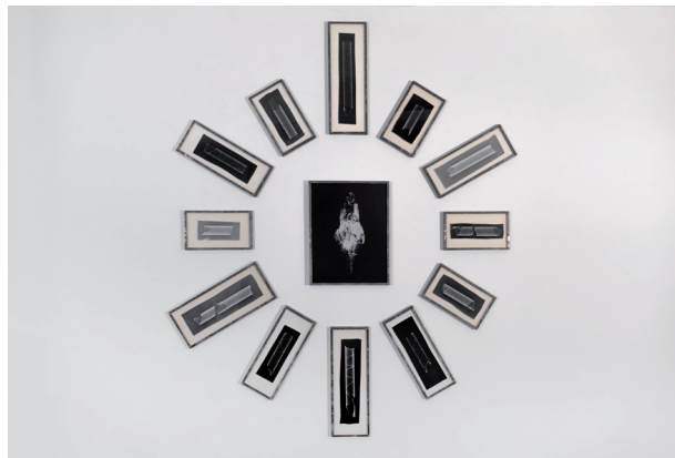
Matriarchal Emergence #06, 12 023-12 024 12 photograms, 1 photograph, black and white prints on Ilford bright silver fibre paper. 120 x 102 cm