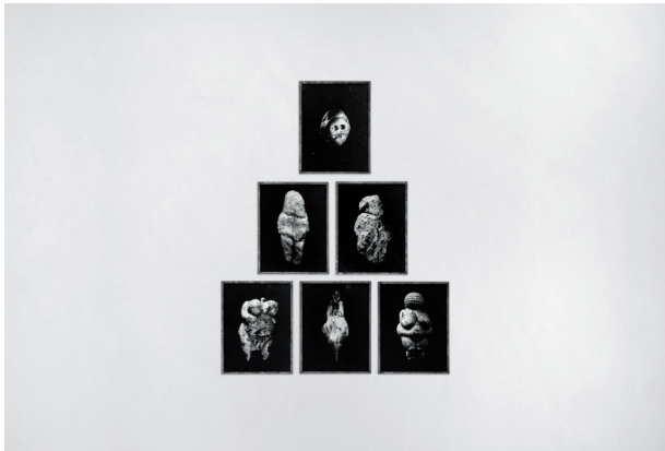
Matriarchs, 12 022 installation of 6 photographs, black and white prints on Ilford mattesilver fibre paper. 96 x 75 cm