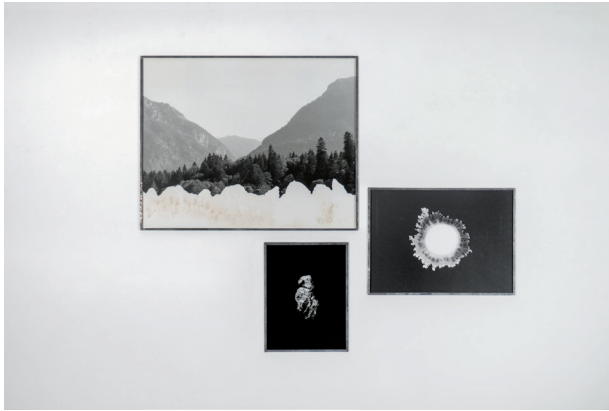
Entropy, 12 024 triptych of photograph, photogram and photograph-photogram, black and white prints on Ilford bright silver fibre paper. 81,5 x 103,5 cm