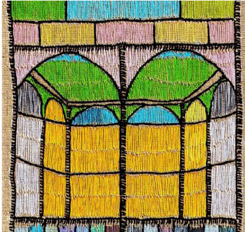
#3. Via Ugoni 3, detail - The Inner Door embroidery on silk, stretched on wood 24,5x17 cm, 2020 - 2024