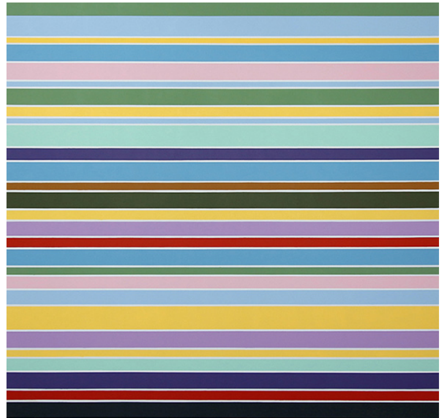
Untitled #4, acrylic on canvas, 190x190cm, 2016