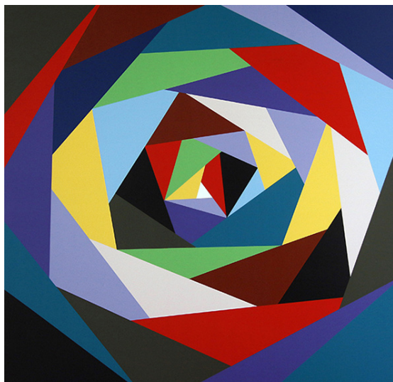
Vertigo #2, 120 x 120 cm, 2016