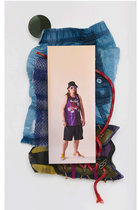
Sun, Get the Look! 2024 inkjet print on Japanese paper, accessories and recycled clothes, wax, wood, 19x32cm