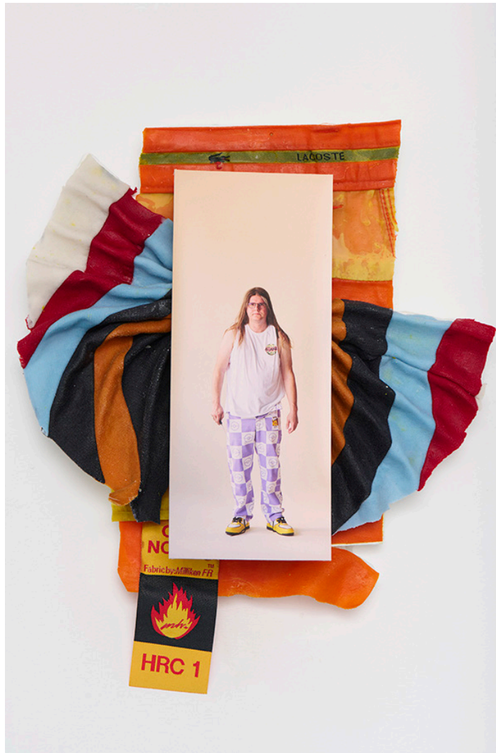
Wed, Get the Look!, 2024 inkjet print on Japanese paper, accessories and recycled clothes, wax, wood, 39x34cm