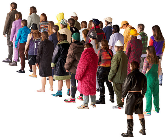
Get the Look! photomontage 2024