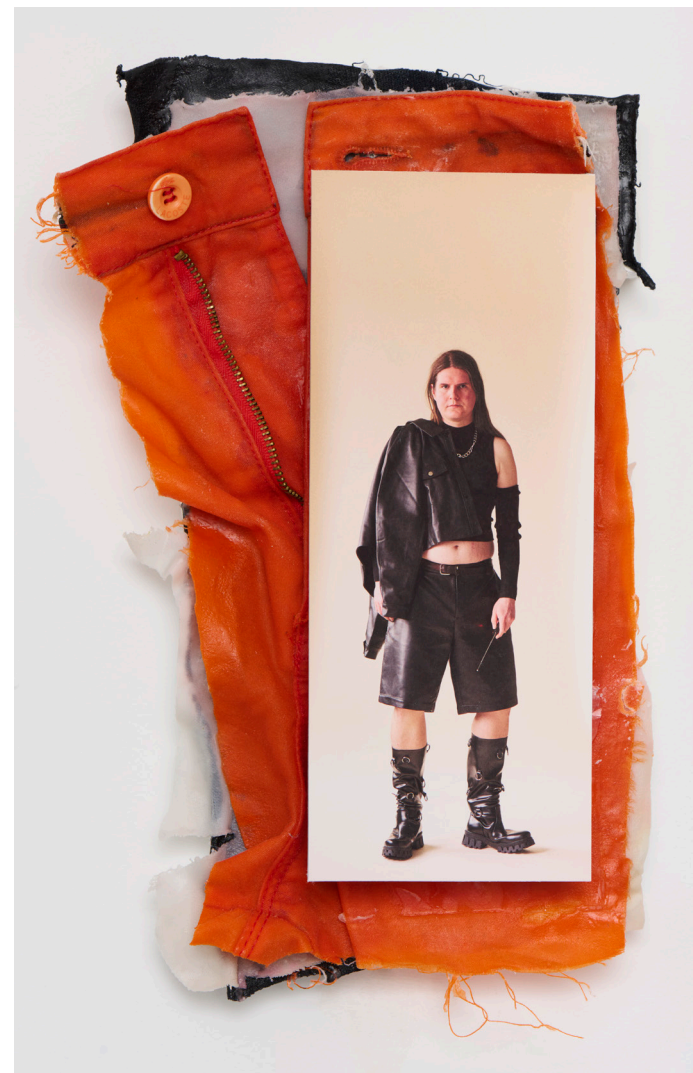
Sun, Get the Look!, 2024 inkjet print on Japanese paper, recycled clothes, wax, wood, 21x31cm

Get the look! appears as a gallery of playful and sarcastic self-portraits that present variations around contemporary issues of vanity, super ego and the illusion of singularity.