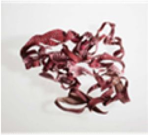
Sheila Concari Pink Medusa python skins, silk, resin variable dimensions