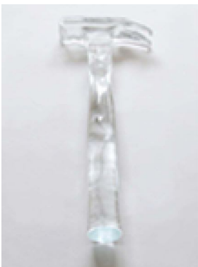
Anne Deguelle Objet de Mélancolie , 2015 cristal 30x11x2cm