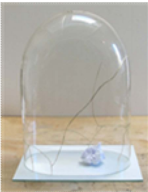
Anne Deguelle Le Monde Kintsugi , 2015 glass, gold, paper 50x42x30cm