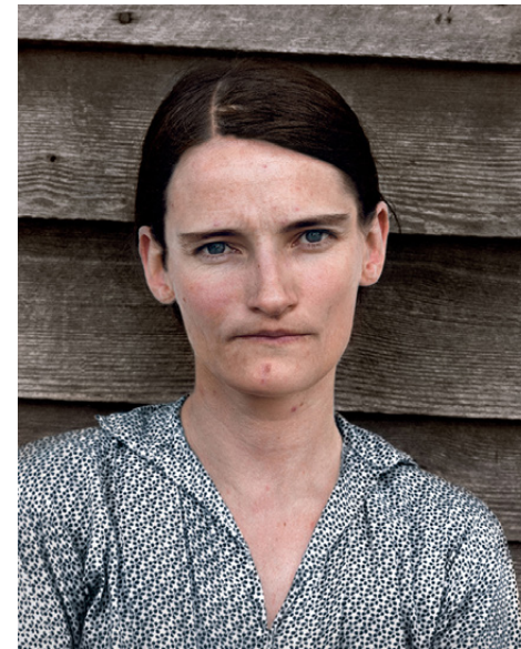
Camille Fallet, She looks like Cotton Tenant Farmer Wife 1936 44x50cm, pigment print, 2016