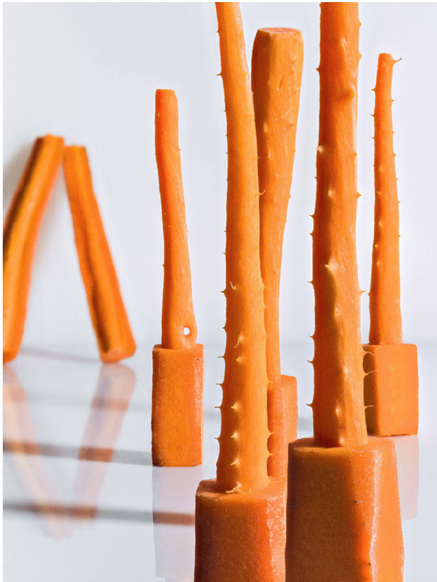
Luca Resta, ripetere ripetere lambda print under plexi, 200x150 cm, 2018