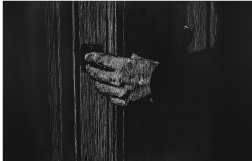
Nemanja Nikolic, Double Noir , video still and drawing with white chalk on blackboard, 70x100 cm