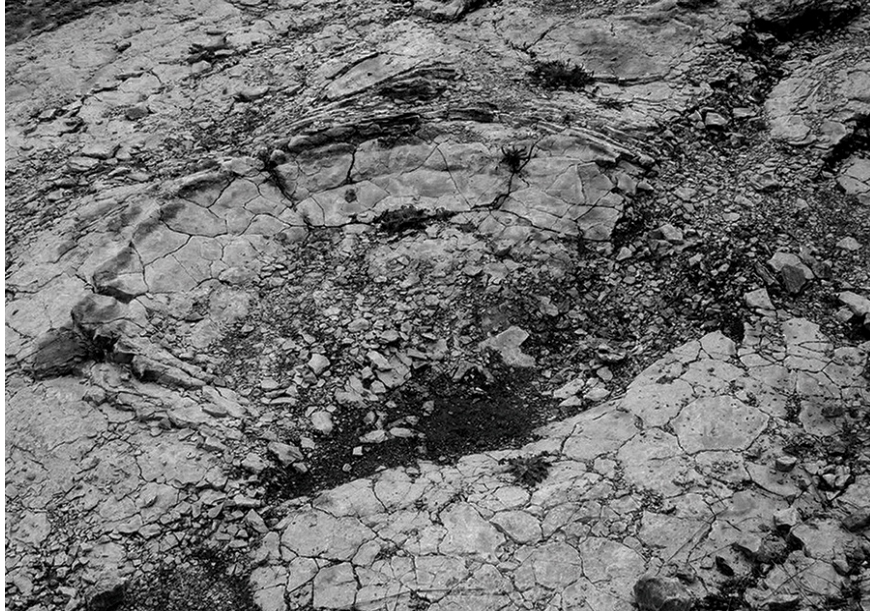
LAYERS (The Print) 50X40 cm / pigment print, 2014