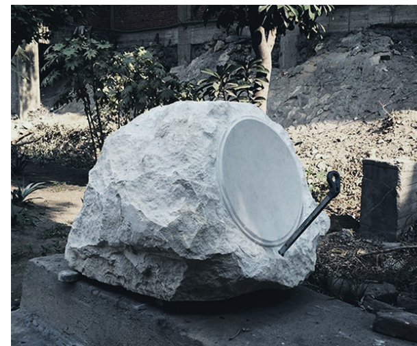
Antenne satellite de pierre No.1, Le Caire, 2015 sculpted stone, system of parabolic antenna, 70 X 70 X 100 cm

European Sound Delta , with Collectif MU : Festival Ososphère, Strasbourg, FR- Festival The Bridge, Roussé, Bulgaria - Festival Belef, Belgrade, Serbia - Air-Antwerpen, Anvers, BE - City Museum, Vukovar, Croatia- Festival Citysonics, Mons, BE- V2, Rotterdam, NL