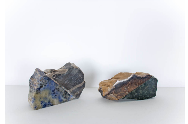
THE COLLECTION Stones cut in the length then perpendicularly at 45 degrees, assembled. 2015

From this emerge forms often composed of reconciliation of various materials or mediums, that the artist collects himself on specific territories. All these forms seem to work together, and therefore become the hosts of narratives in layers, that time completes and enrich with complexities.