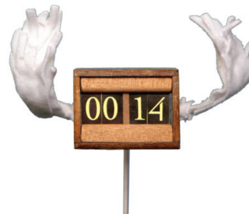
Compteur volant (jeu du Lapin carotte) wooden box, tissu, metal rods, cardboard 2013

with support of Bretagne and Nord-Pas-de-Calais