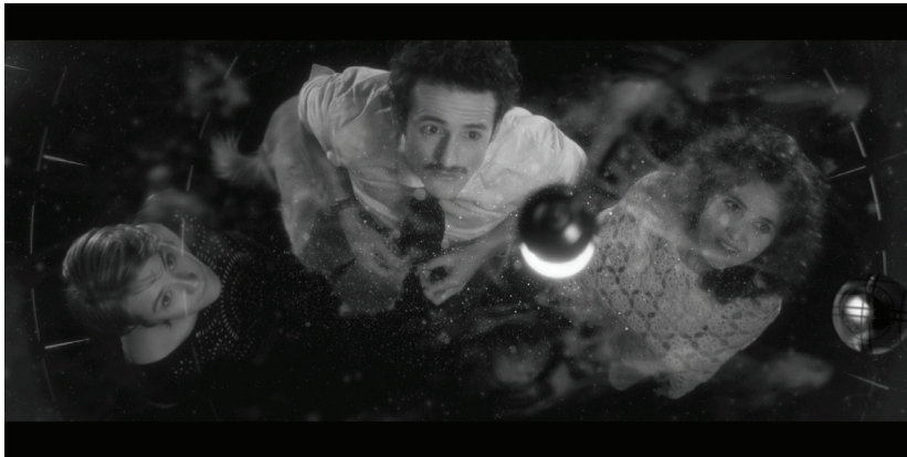
What makes me take the train , video 14'45, Prix Studio Collector 2013 Production Le Fresnoy, Studio National des Arts Contemporains