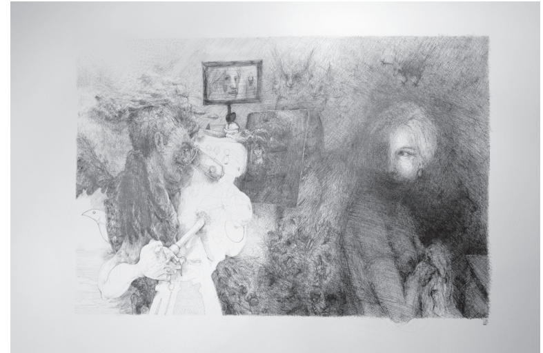
Working with this actress a little devil appeared between us felt on Arches paper, 65 x 50 cm, 2014