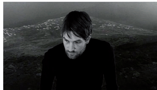
îles/elles video, black and white, 10', sound, 2010