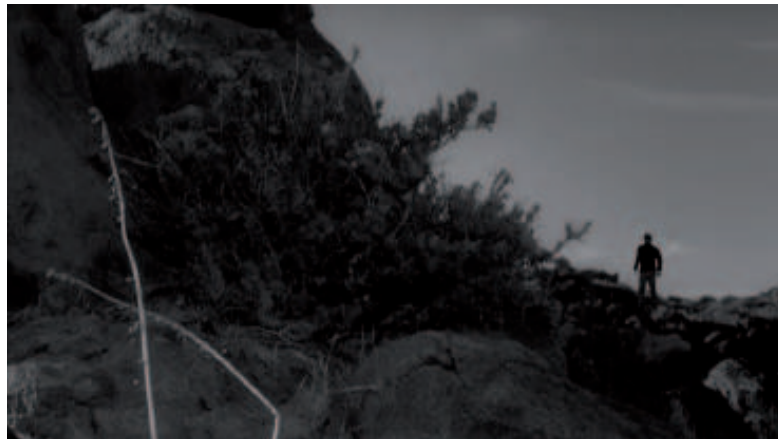
îles/elles video, black and white, 10', sound, 2010

The Galerie Dix9 is pleased to introduce you to :