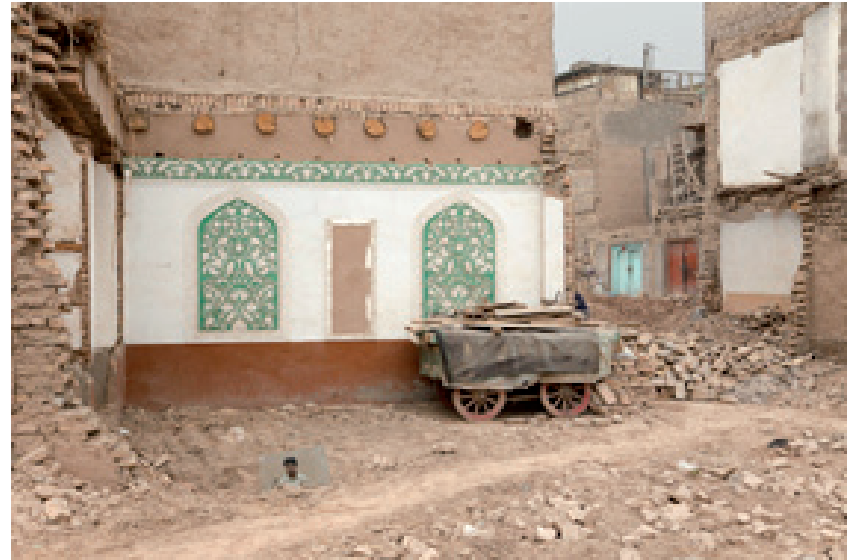
The Deposessed inkjet print, 120 x 80 cm, 2010- 2011