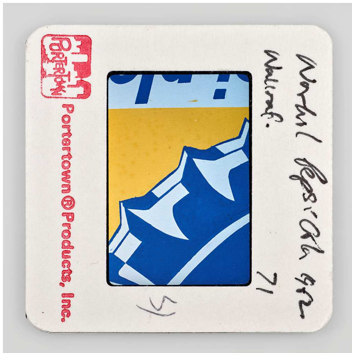
Warhol Pepsi Cola 1962 Wallraf 71 b) Portertown (R) Products, Inc, 2020