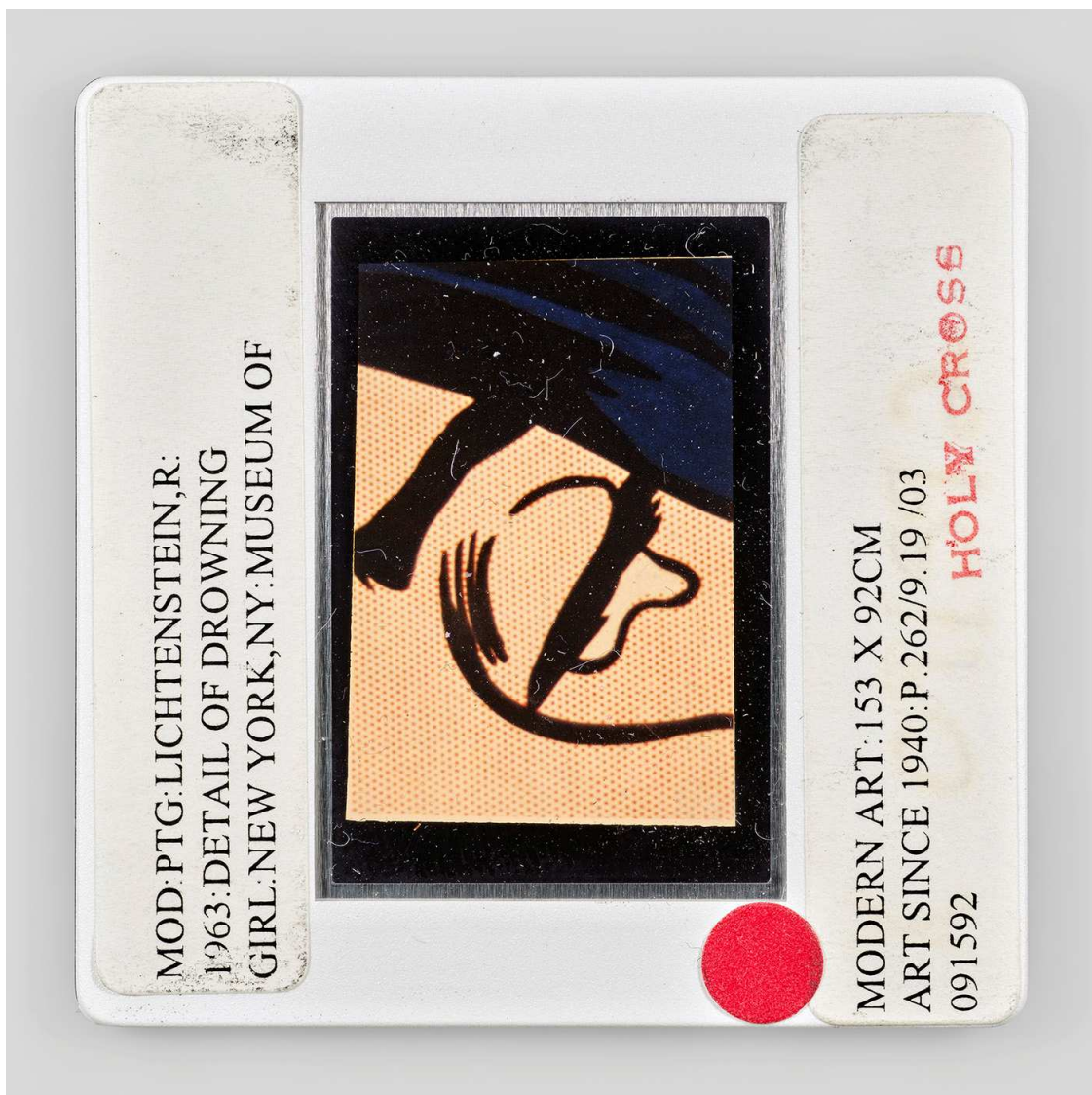
MOD-PTG-LICHTENSTEIN,R-1963-DETAIL OF DROWNING GIRL-NEW YORK,NY- MUSEUM OF MODERN ART-153 X 92CM ART SINCE 1940-P.262_9.19_03 091592 HOLY CROSS, 2020