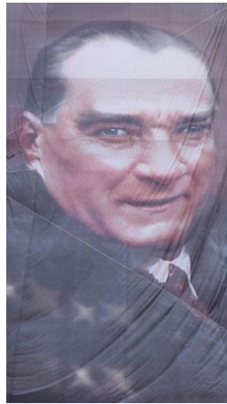
Atatürk 2 2'06 loop

Each video is showing one portrait of Mustafa Kemal Atatürk hung high above the head of the visitor. The original images are monumental flags hanging in front of five storey buildings for a national holiday in Istanbul. From time to time the wind starts to move the flag and animates the image. The facial expression changes from sometimes stern to sometimes an ironical smile.