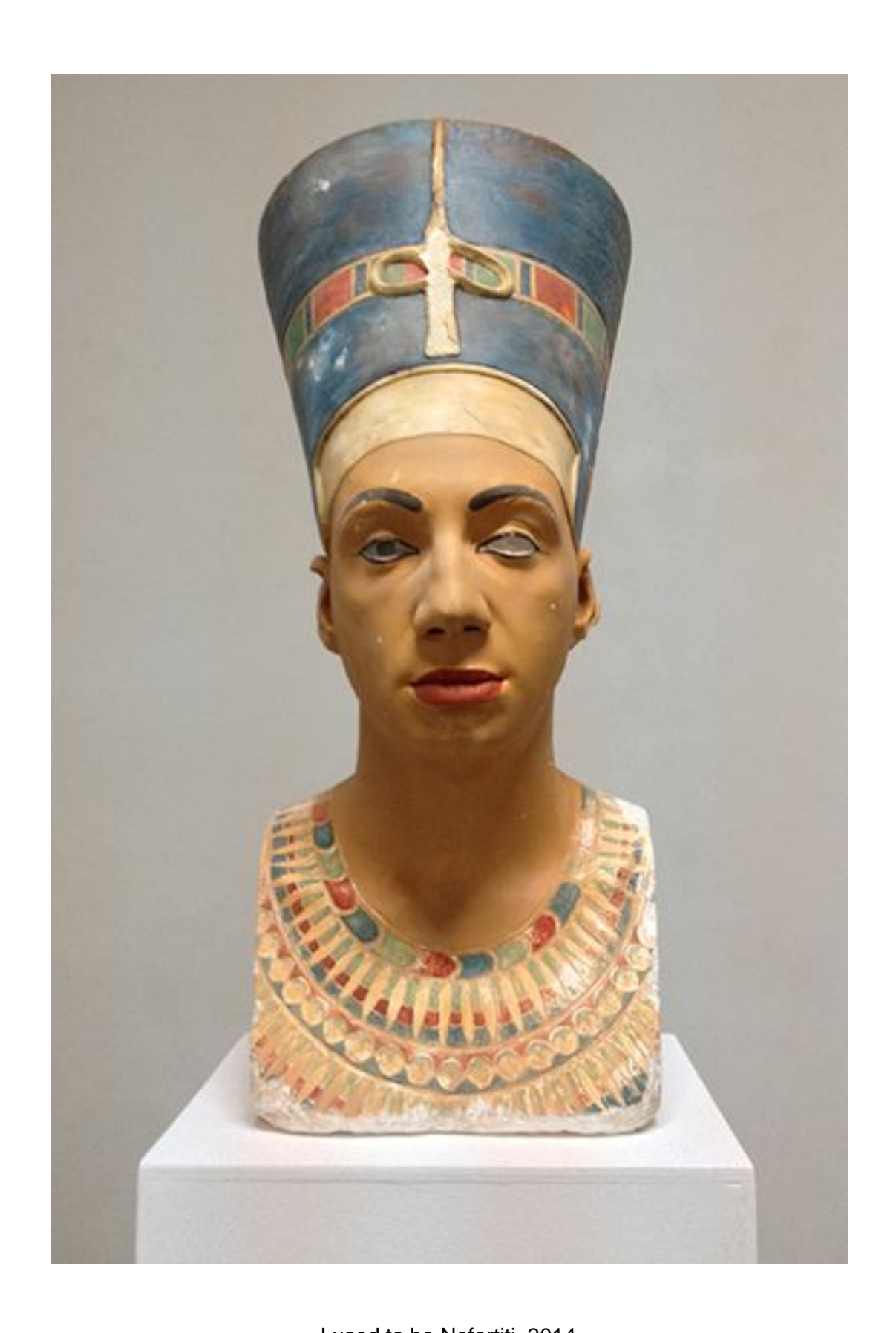
I used to be Nefertiti, 2014 plaster, gesmonite, polystyrene, paint 60 X 44 X 23 cm unique