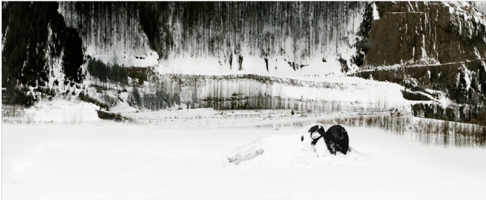
Existential Emptiness 5 130 x 57 cm, 2009