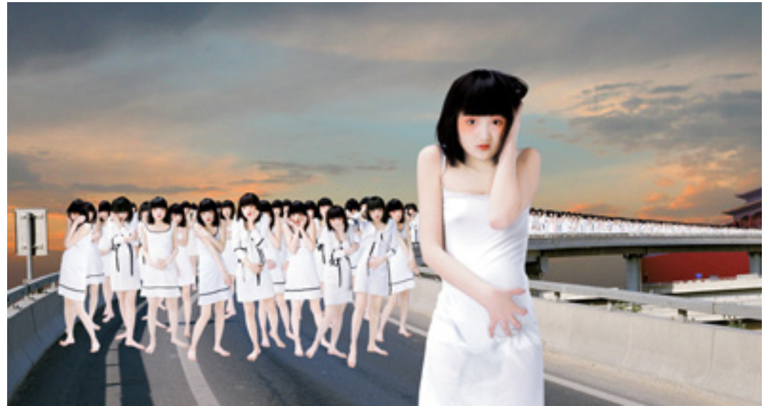
Angel 4 170X90.92 cm, 2006