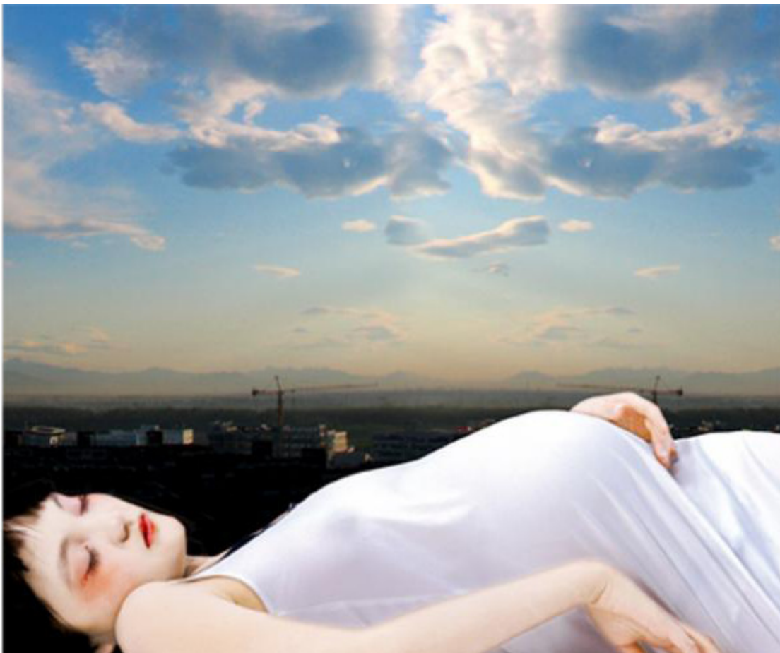
Angel No.13 80x66.67cm, 2006

The Galerie Dix9 is pleased to introduce you