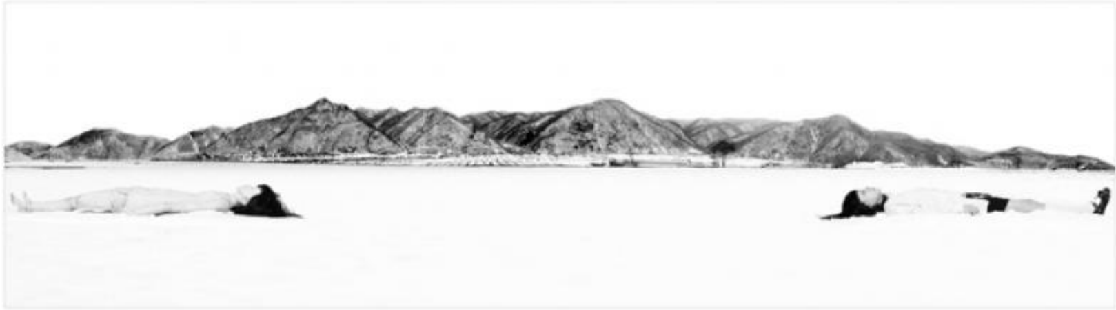
Existential Emptiness 1 243 x 67,5 cm, 2009