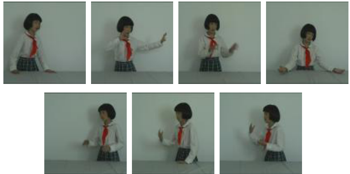
Sanjie installation vidéo, dimensions variables