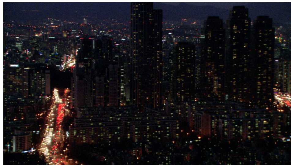
PHONE TAPPING production of The Fresnoy, National Studio of Contemporary Arts