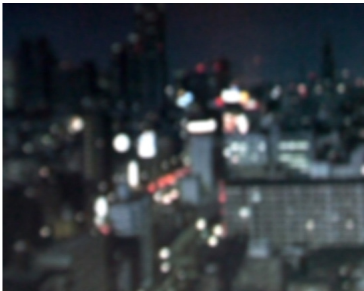
KARAOKE Video colour, stereo sound, 2009