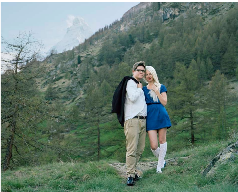
“Demande en mariage (Mariage proposal),” from the series Ekaterina, 2012