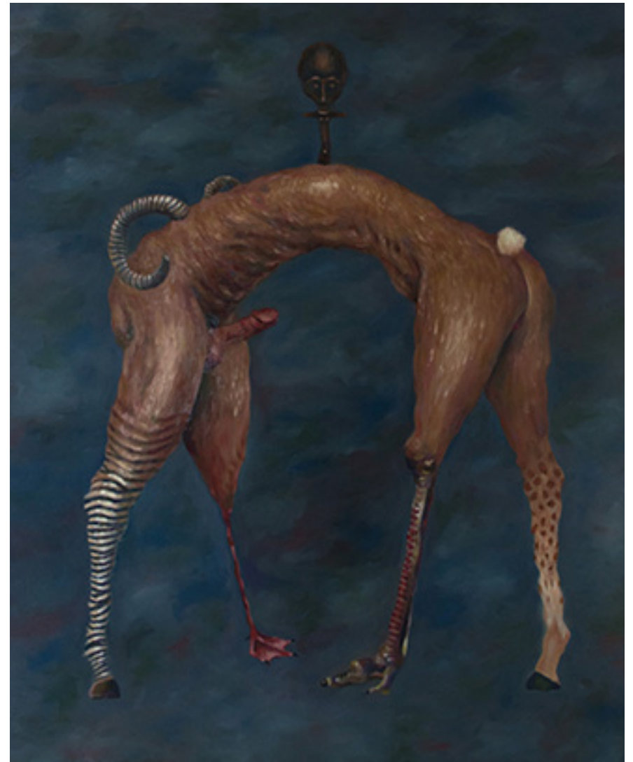
Desire Arch, oil on canvas, 162 x 130 cm, 2016