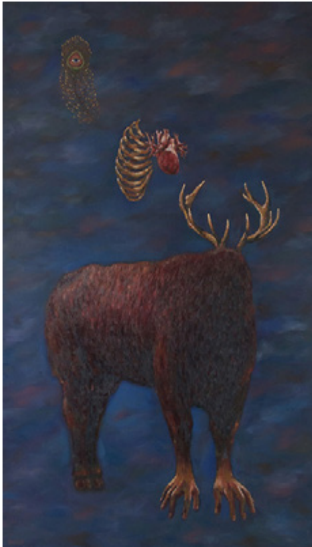
Undergrowth Stroll, oil on canvas, 194 x 114 cm