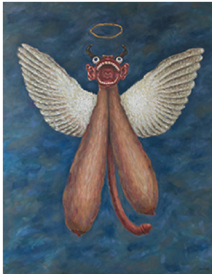
Flesh Makes the Head Spin, oil on canvas, 146 x 114 cm