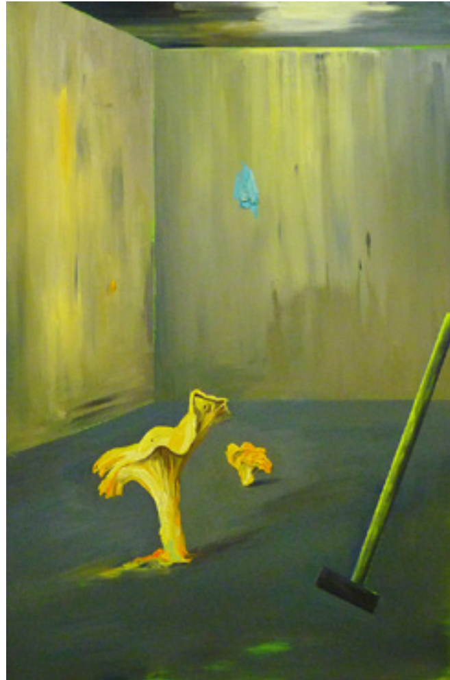
Remains oil on canvas, 195 x 130 cm, 2018