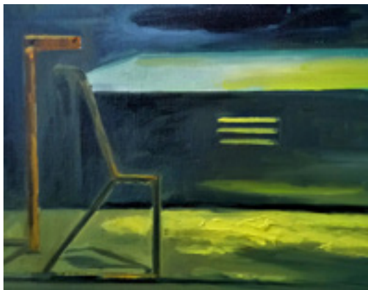
I want you my Polish guy oil on canvas, 35 x 27 cm, 2018