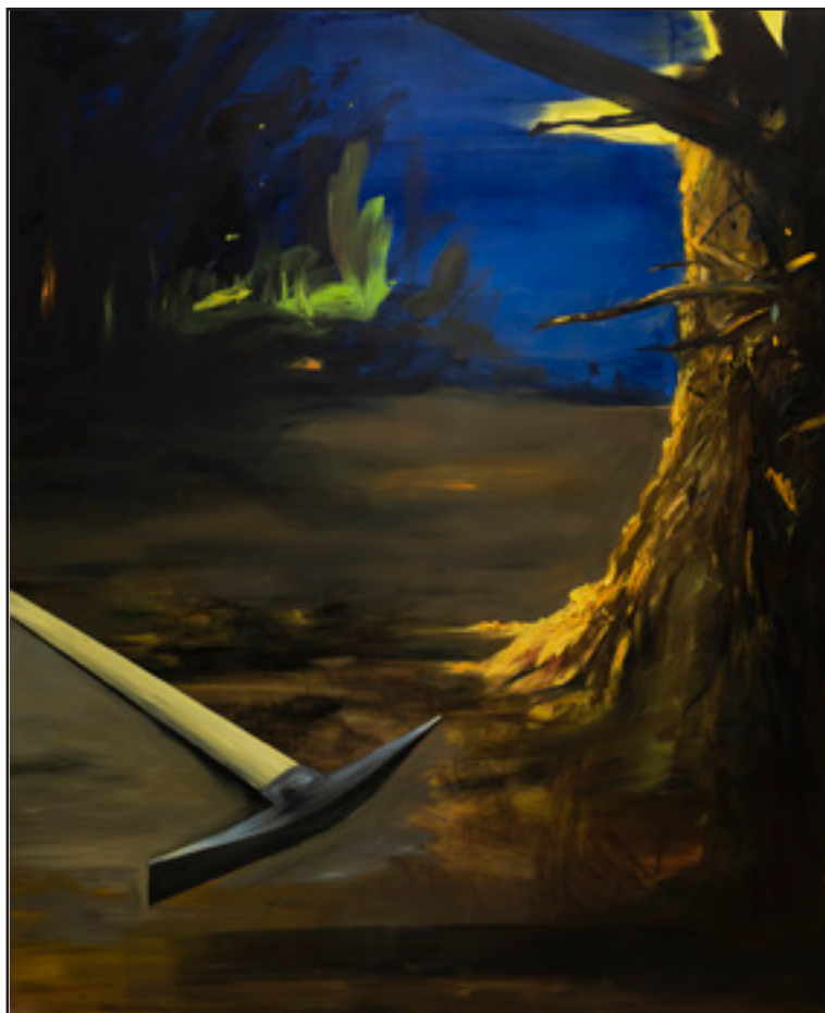
Jak papieros pod prochami Wilna (Like a cigarette under the ashes in Vilnius) oil on canvas, 200x160cm, 2018