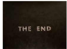
Nemanja Nikolic , Love Drawing #3 charcoal on paper, 50x40cm, 2017