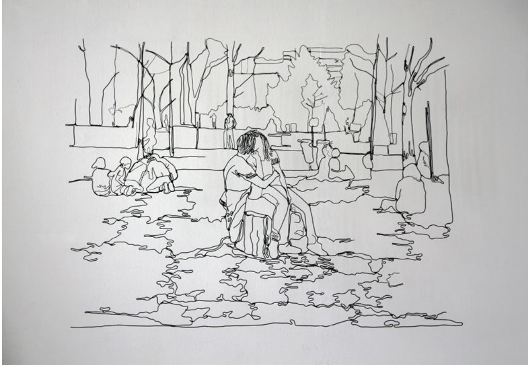
Nina Ivanovic, Months 3 metal wire, acrylic, 140x100cm, 2017

To be hang 15 cm from the wall, so that the shadow of the drawing reflects on the wall