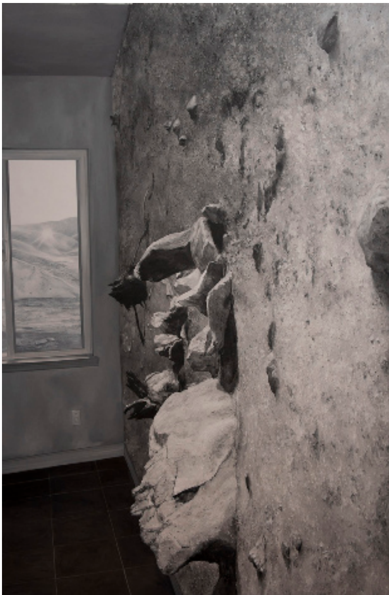
No title , 2012 oil on canvas, 215 x 145 cm