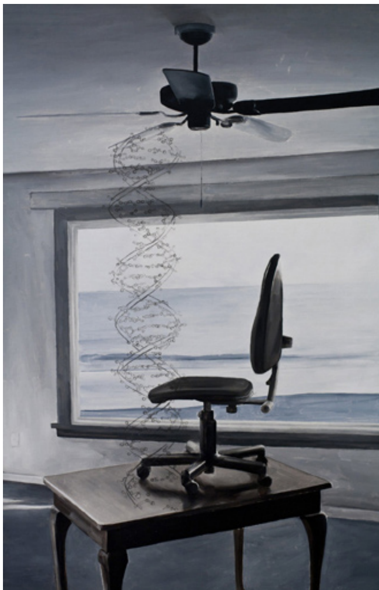
Everybody is real (detail) , 2011 oil and graphite on canvas, 65 x 80 cm