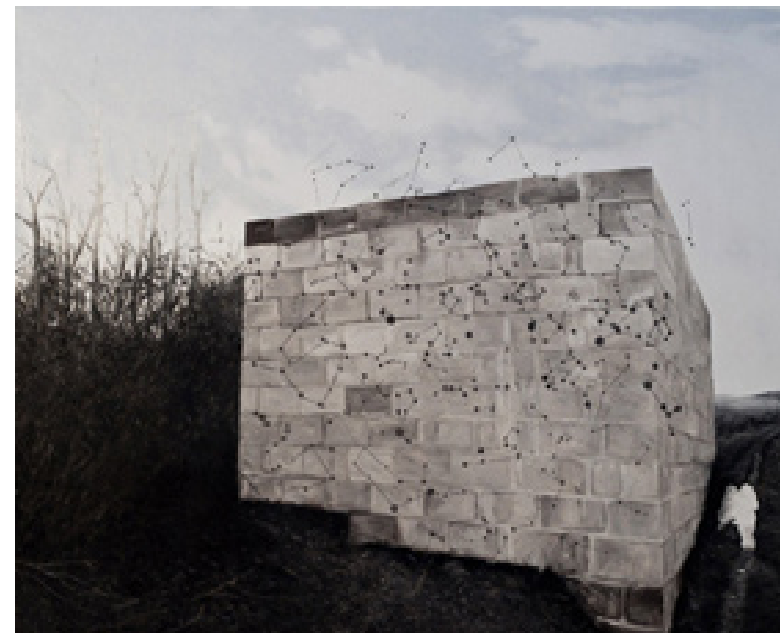
Making space , 2011, oil and graphite on canvas 60 x 80 cm