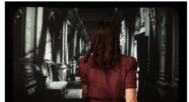
Antichthones 1, 2012

Museum of Modern and Contemporary Art, Mamco Geneva Maison Européenne de la Photographie, MEP Paris New National Museum of Monaco François Pinault Fondation Julius Baer, Switzerland La Maison Rouge, Paris La Fabrique, Marseille, France