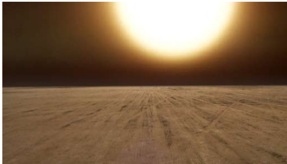
Erehwon (sun) , 2012 16/9 video, color, infinite loop, silent