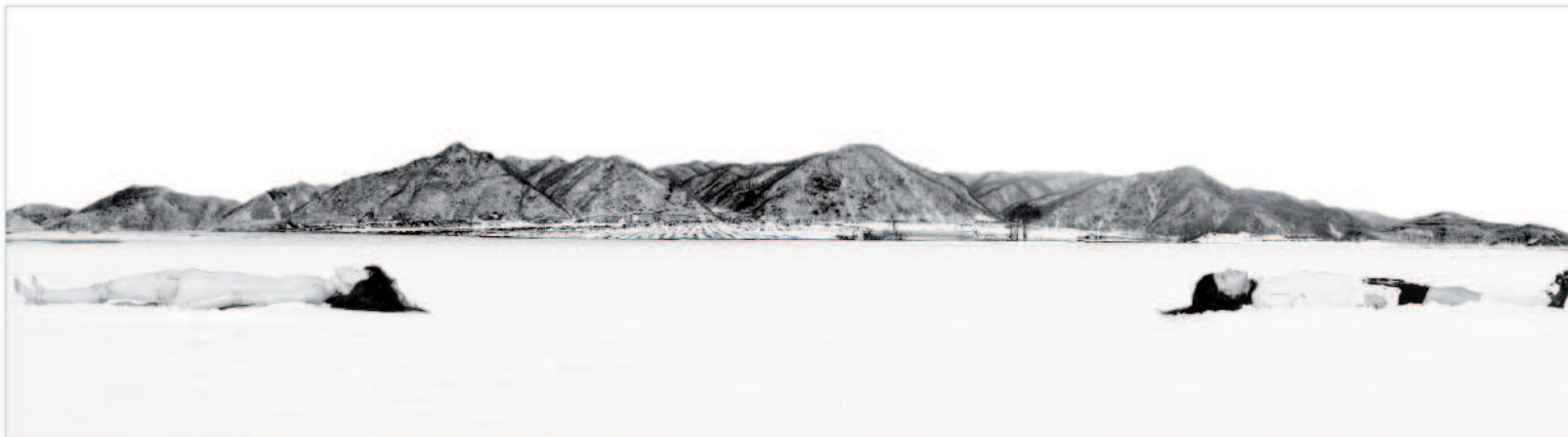
Existential Emptiness 1 243 x 67,5 cm, 2009