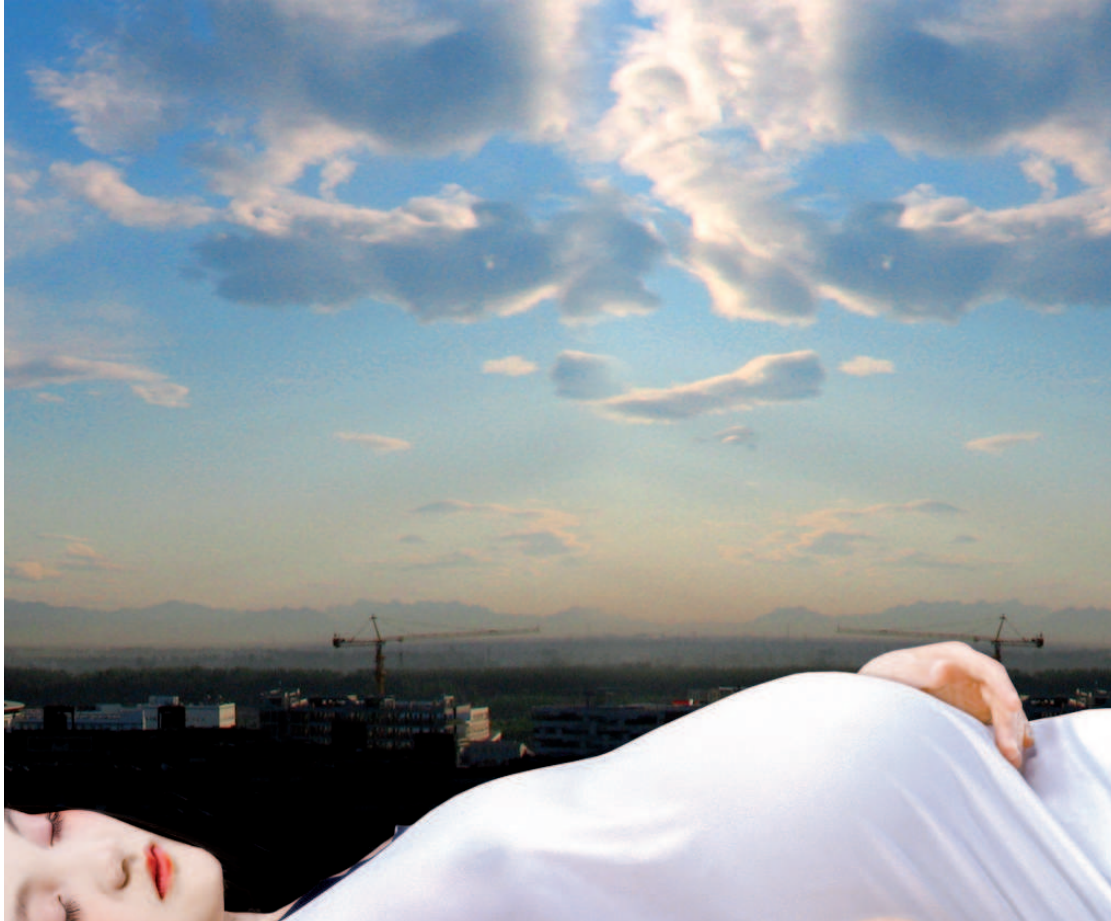
Angel No.13 80x66.67cm, 2006

The Galerie Dix9 is pleased to introduce you