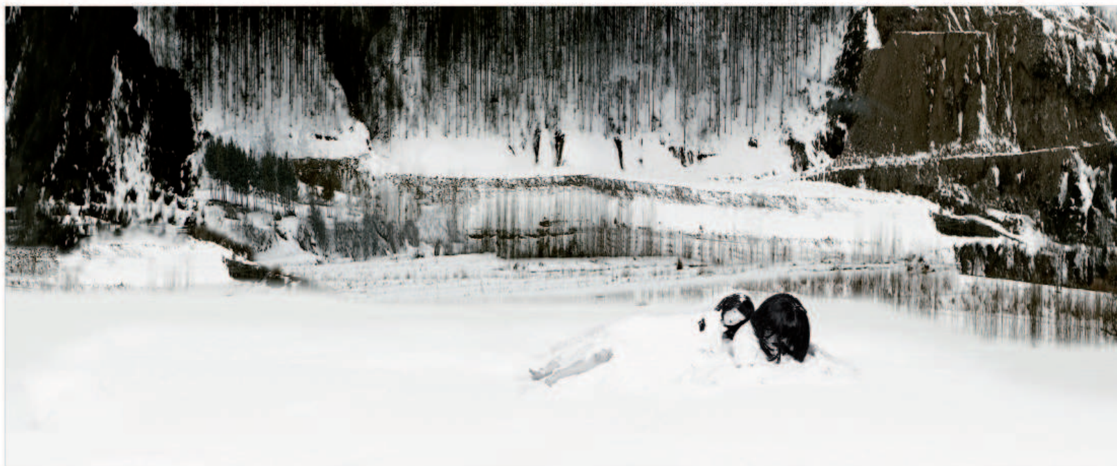
Existential Emptiness 5 130 x 57 cm, 2009