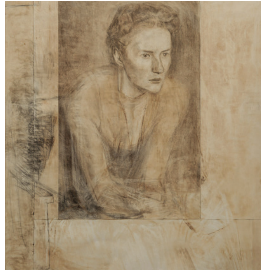
FREDERIQUE, 1984, charcoal on paper, 131 x 135,5 cm