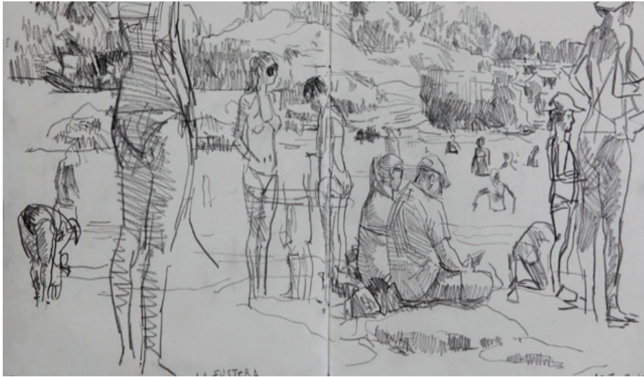
COAST LINE, graphite «pierre noire» on paper, 24 x 49,5 cm