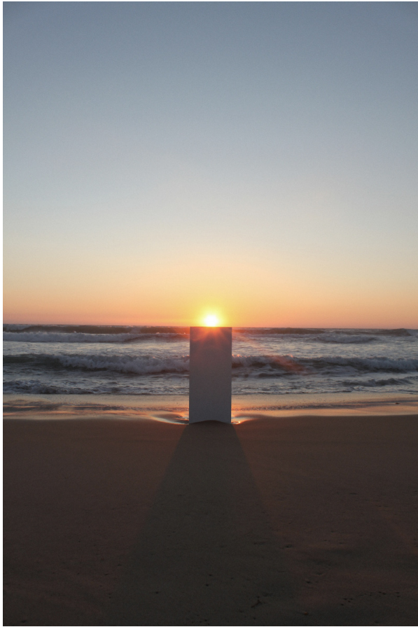
Endless Show , 2013 Lambda print mounted on aluminum 120 x 80 cm + oak frame