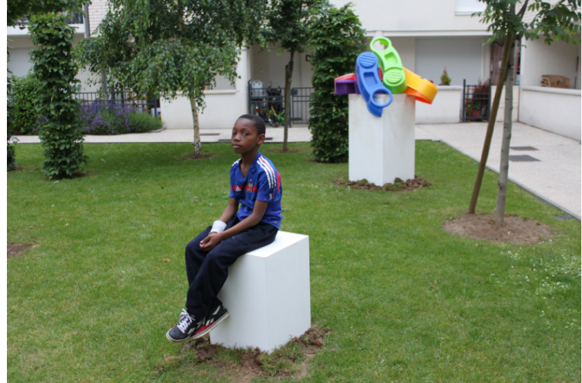
Together , 2013 bases, acrylic paint, everyday objects variable size exhibition view, Cité de l'Avenir, Paris