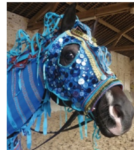
Blue Caparaçon 2011