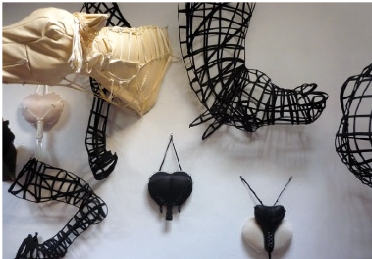
Tia-Calli Borlase - Atelier view

Galerie Dix9 is pleased to introduce Tia-Calli Borlase