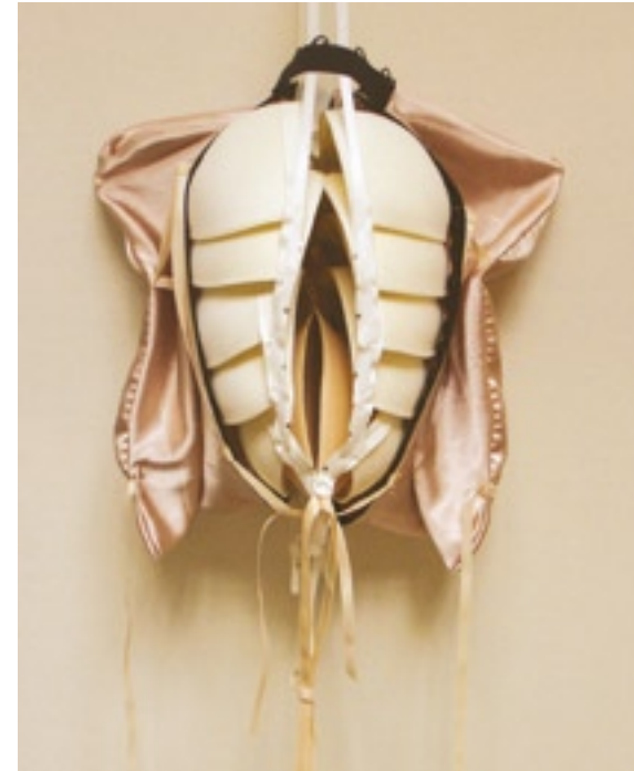
Sculpture membrane N° 35, 2008 bra cups, satin

Nuit Blanche : Faux-semblants en duo , Love Box, Miss China, Paris. Slick , galerie Miss China, Paris. Select 02 Beauty Room , Miss China, Paris. Select 01 Beauty Room , Miss China, Paris.